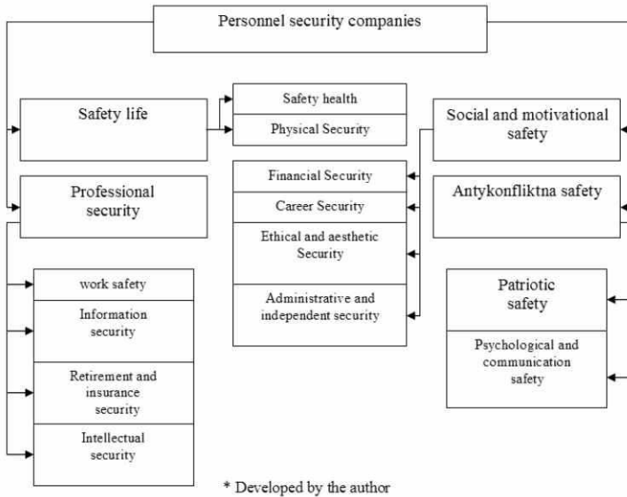
Figure 1. Components of personnel security company *

Development of health safety is not fully vested in the company. Important role in securing the health, particularly in traumatic industries, enterprises whose economic activity is associated with a significant risk to life and health, trade unions play. Thus, Article 21 of the Law of Ukraine "On Trade Unions, Their Rights and Guarantees" set: "Trade unions exercise public control over the payment of wages, compliance with labor legislation and labor protection, the provision of safe working conditions, adequate production and sanitation conditions, workers' clothing, footwear and other means of individual and collective protection. 2 In case of threat to the life or health of workers, trade unions have the right to require the employer to stop work immediately in the workplace, manufacturing sites, in workshops and other structural subdivisions or company in general for the time required to eliminate the threat.